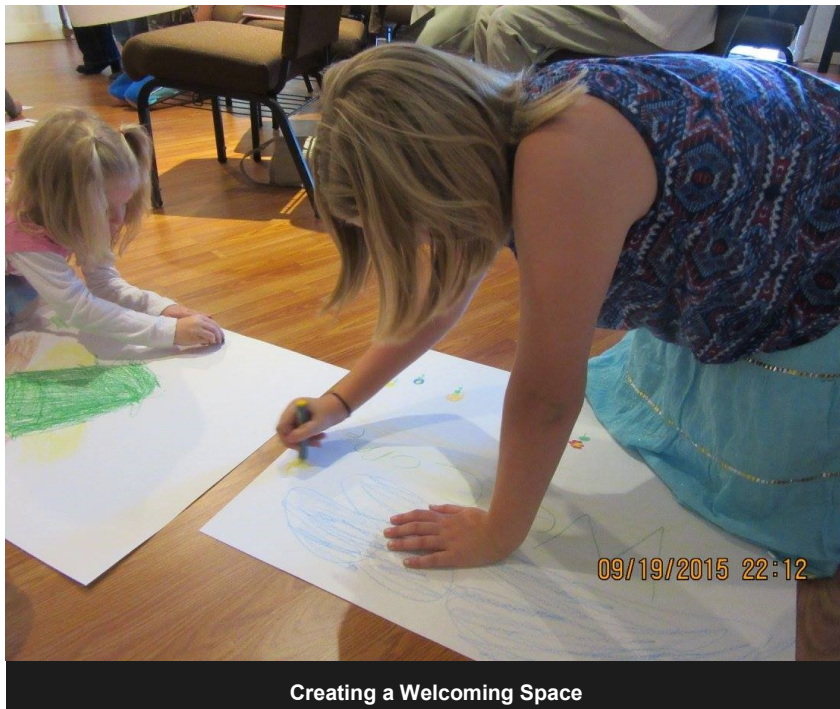
Creating a Welcoming Space