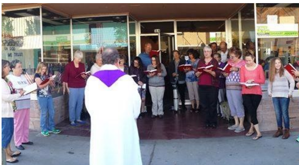
Door Step Singing—First Steps Into the Marketplace!