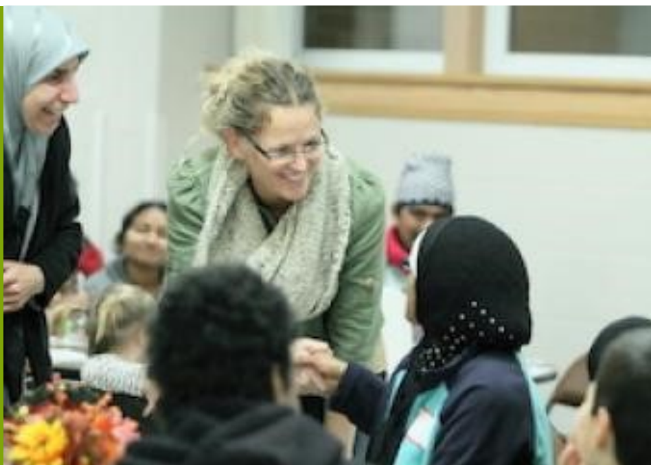
The View From The Village